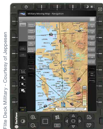
Flite Deck Military

Total document viewing (approach plates, checklists, manuals, etc.) Aircraft performance management