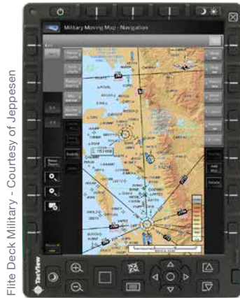
Flite Deck Military

Total document viewing (approach plates, checklists, manuals, etc.) Aircraft performance management